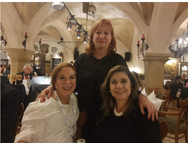
EuroMedLab 2021, Munich, April 12, 2022