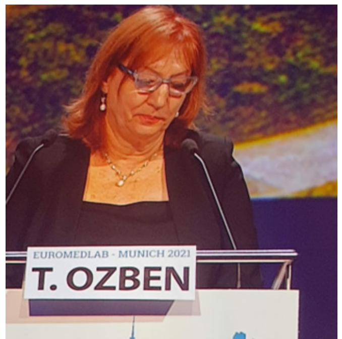
Munich, Opening Ceremony EuroMedLab 2021, April 11, 2022