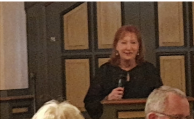
EuroMedLab 2021, Munich, April 12, 2022