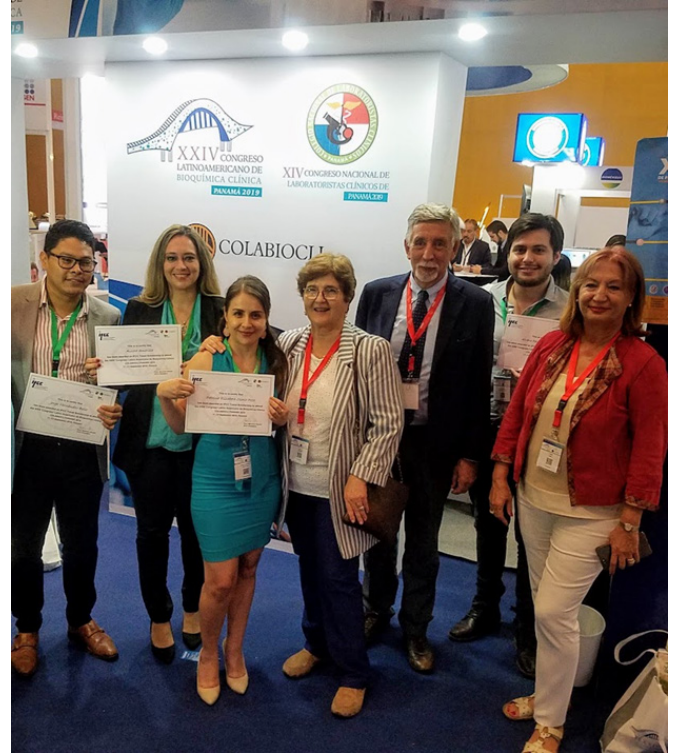
Panama 2019, XXIV COLABIOCLI CONGRESS