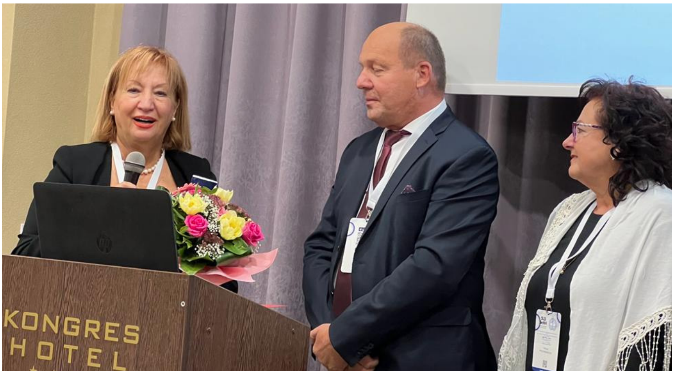
Honorary membership award ceremony of the Slovak Society of Clinical Biochemistry held today on October 9, Sunday, 2022.