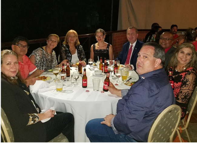
Panama 2019, XXIV COLABIOCLI CONGRESS