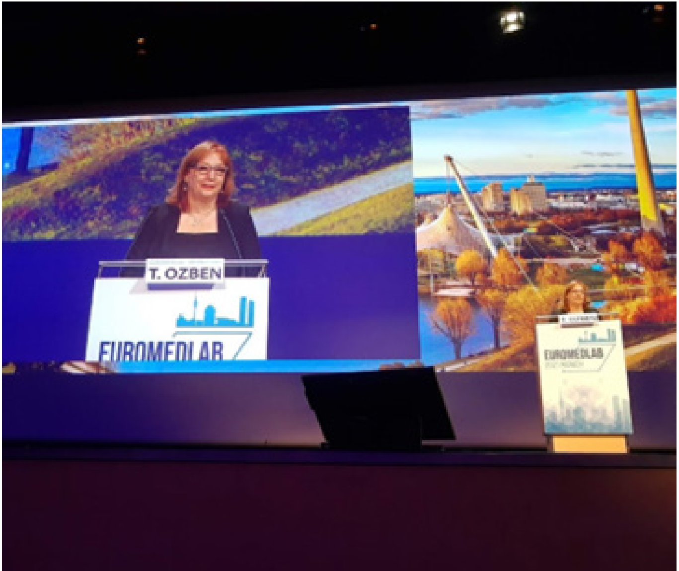
Munich, Opening Ceremony EuroMedLab 2021, April 11, 2022