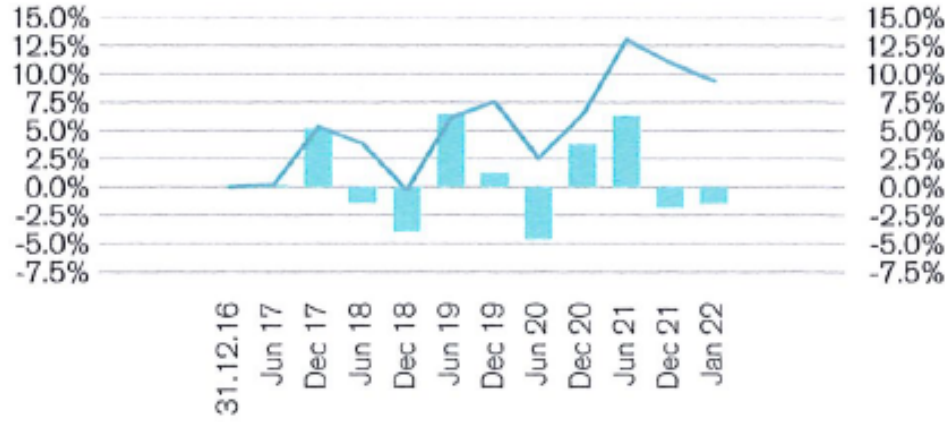
Return overview since inception Period 31.12.2016 - 31.01.2022

■ Portfolio return (TWR) (left) — Cumulative return (TWR) (right)