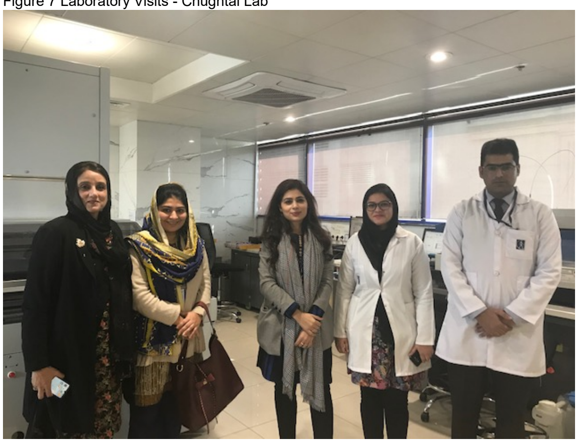
Figure 8 Day 3 Laboratory visits – Laboratories opposite Services Hospital, Jail Road, Lahore

Figure 7 Laboratory Visits - Chughtai Lab