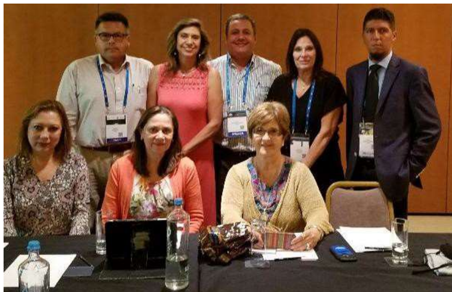
Athens, 8 Countries attended the meeting