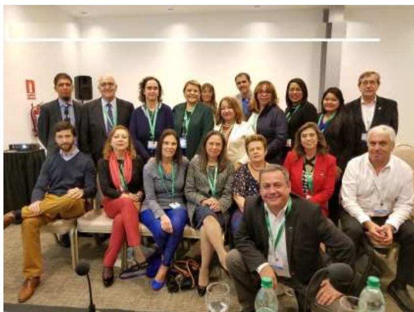
Punta del Este 13 countries attended the meeting, including Panama, with almost