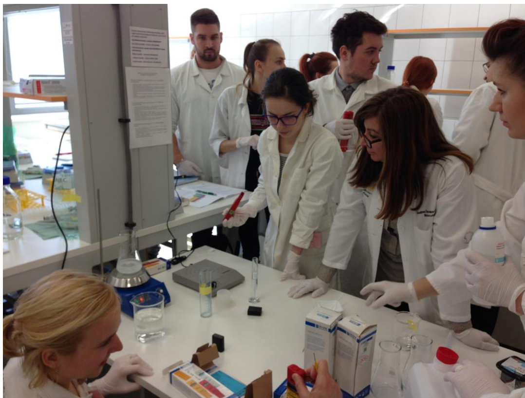
Preparation of buffers and solutions