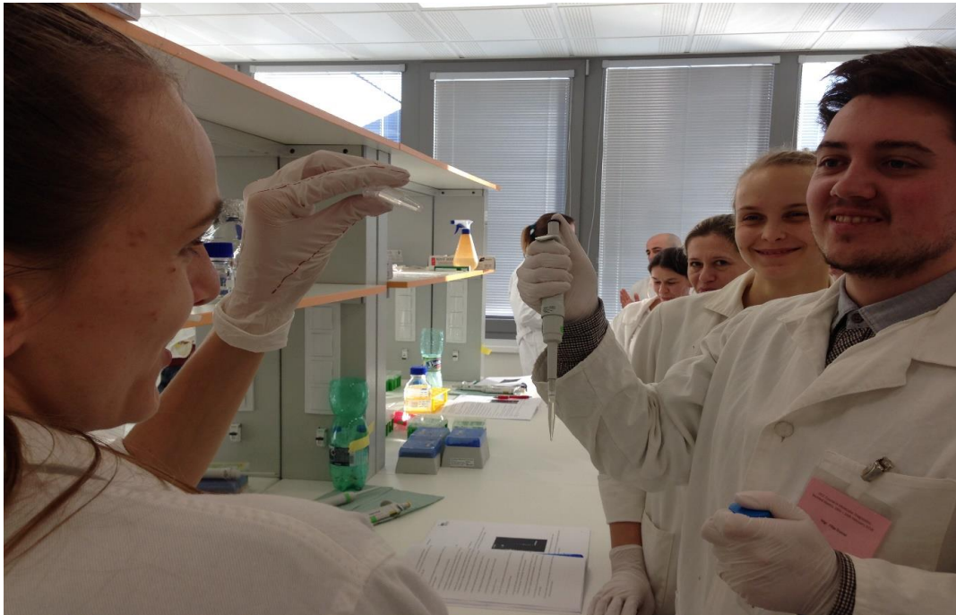
isolation of genomic DNA