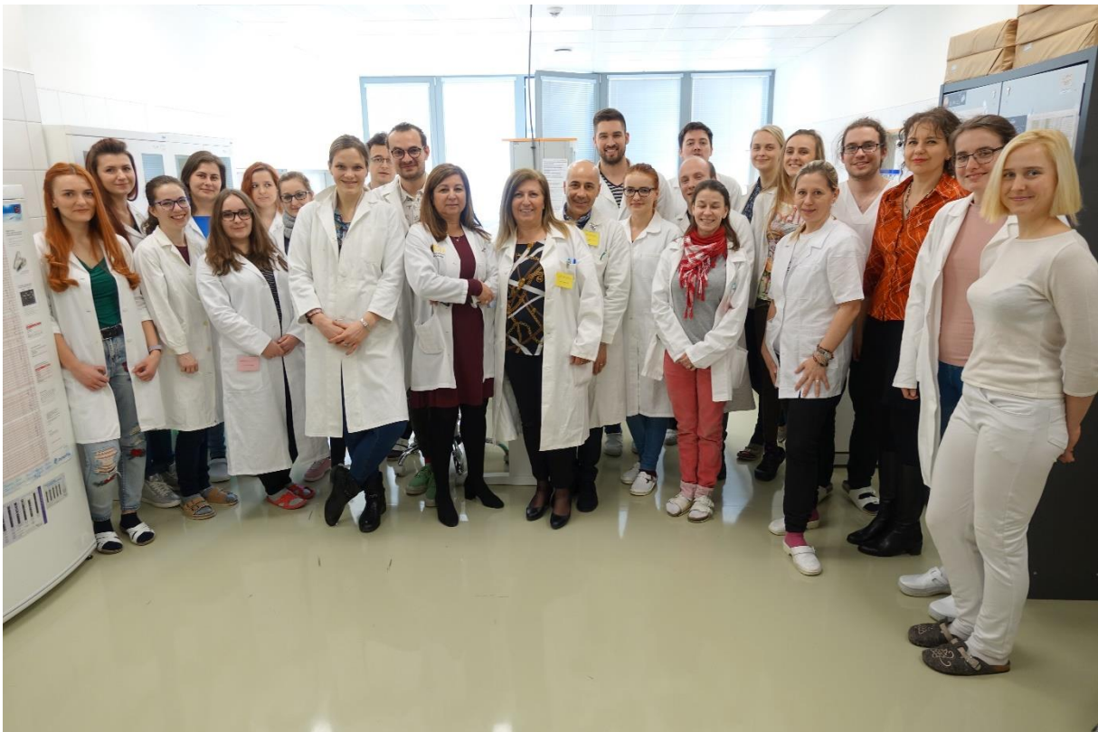
The course participants and the tutors

The 9 th IFCC Beginner's Course in Molecular Biology organised by C-CMBC took place at Biomed in Martin, Slovakia from the 18 th to the 24 th February 2018.